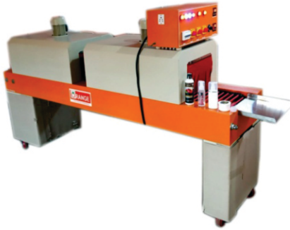
DUAL CHAMBER SHRINK TUNNEL