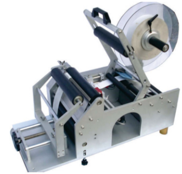
SEMI AUTO LABELING